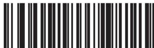
HID Device Conversion

(Optional): Enable Enhanced Micro USB Charging